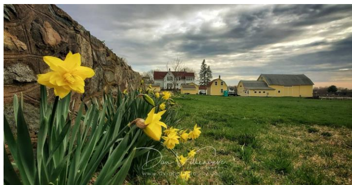
"Where flowers bloom so does hope." – Lady Bird Johnson

AND A SPECIAL THANKS TO ALL OTHERS WHO HELPED MAKE OUR YEAR A SUCCESS!