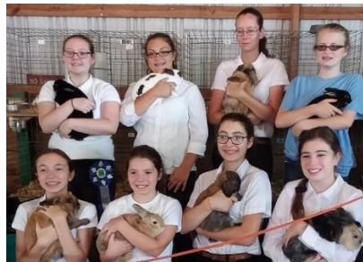
-4-H: Unchanging values in an ever-changing world-