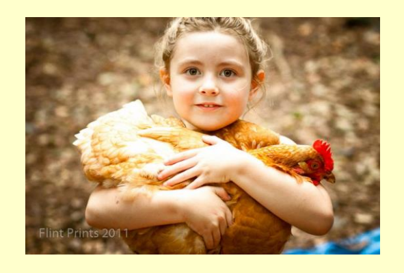
EXTRA FUN Guess the date of the first egg!

1 guess per supporter 1 guess per date See calendar located at farm for details.